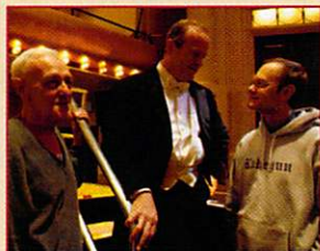
1. A Frasier reunion at a break in the dress rehearsal: John Mahoney, Kelsey Grammer (the Philharmonic's Higgins), and David Hyde Pierce