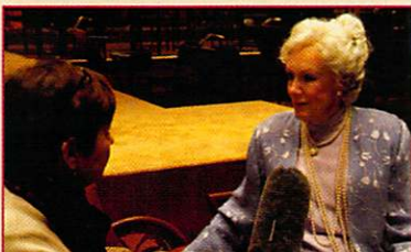
2. CBS News correspondent Martha Teichner (left) interviewing Marni Nixon, in costume as Mrs. Higgins